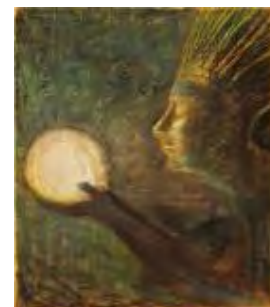
M. K. Čiurlionis, Friendship

Psychoanalysis, Trauma and Severe Mental Disorders